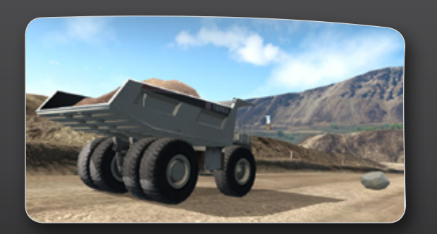
Safe Operating Procedures