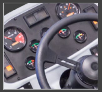
Machine controls and instrumentation are faithfully reproduced to give maximum realism

Enquiries@ImmersiveTechnologies.com www.ImmersiveTechnologies.com