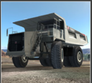
Accurate operational characteristics using technology and data based on Terex TR100 Truck model

With mining equipment becoming increasingly technically sophisticated, the level of information, experience and organizational competencies required to accurately simulate these machines also increases. Through Immersive Technologies' industry experience, you can be assured your training solution will deliver maximum learning impact.