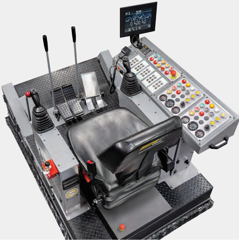
Simulated main display.