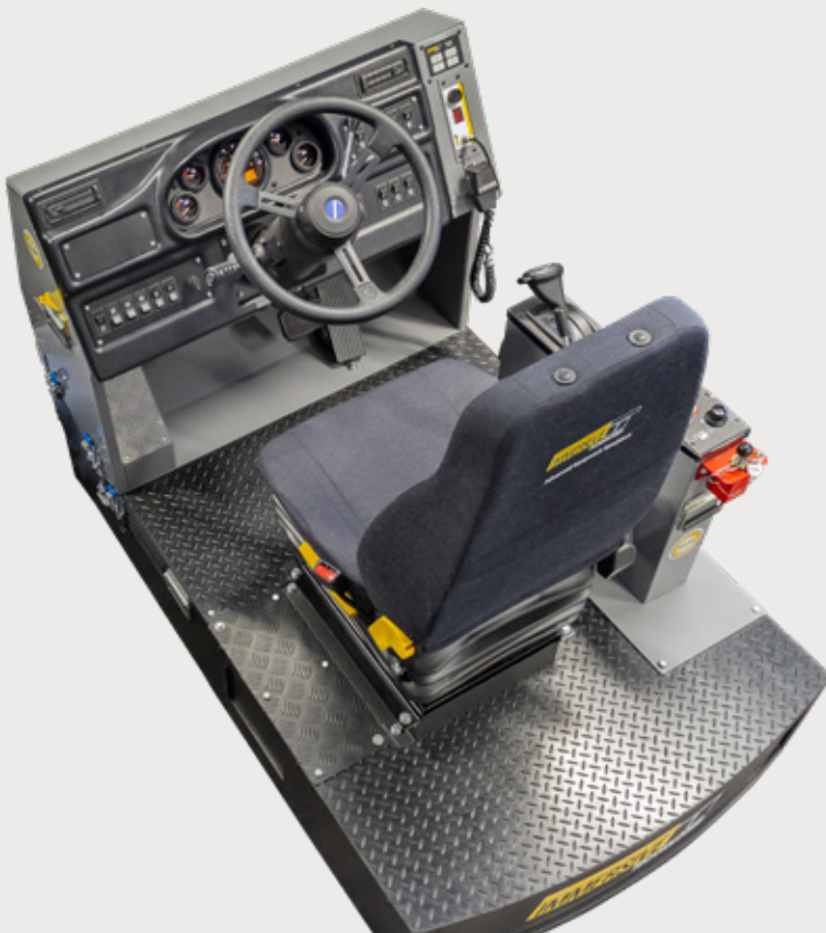
Genuine Komatsu gauges