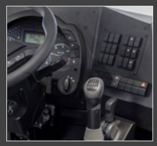
Accurate instrumentation and controls provide a safe and highly realistic training environment