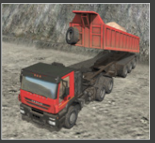
Machine dynamics faithfully reproduced to give maximum realism

With mining equipment becoming increasingly technically sophisticated, the level of information, experience and organizational competencies required to accurately simulate these machines also increases. Through Immersive Technologies' industry experience, you can be assured your training solution will be the only accurate and true representation of the real machine available.