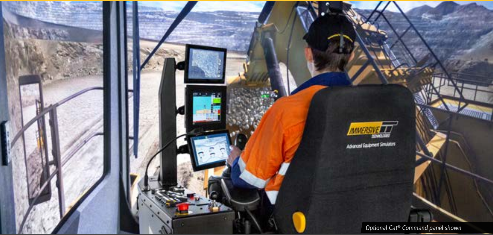
Optional Cat® Command panel shown

Ask to see Immersive Technologies' extensive catalog of quantified business improvements, solving problems in areas such as safety, productivity, reactive maintenance and the availability of skilled equipment operators.