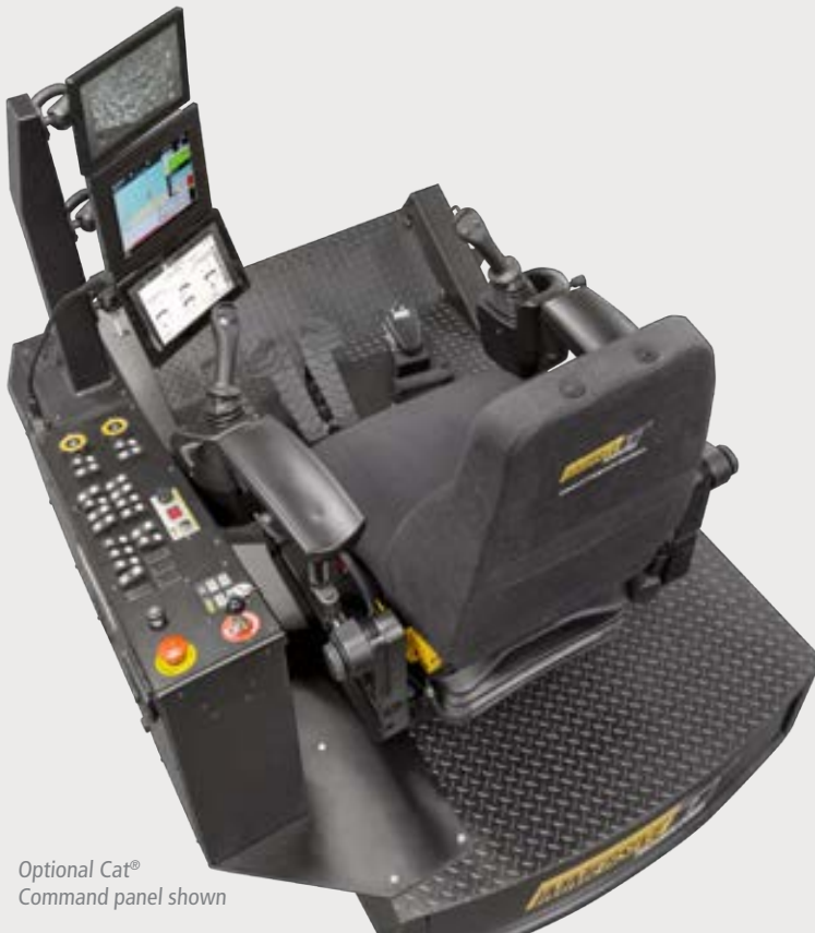
Optional Cat® Command panel shown

Display screens for Information Monitoring, Camera views and (optional) Cat® Command.